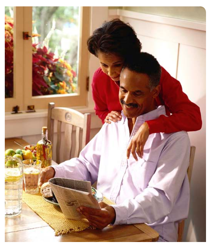
Check with your doctor before resuming sexual activities. You should be able to have sex the way you did before your heart attack.